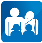
FAMILY FLOATER HEALTH GUARD